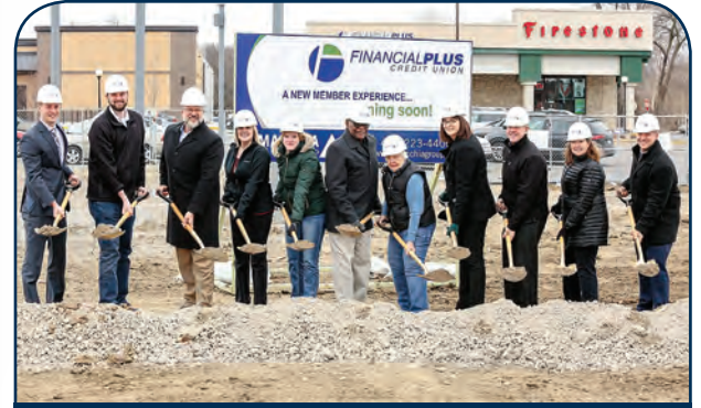
April 6, 2018 – FPCU board and management commemorated the Fleur construction project.